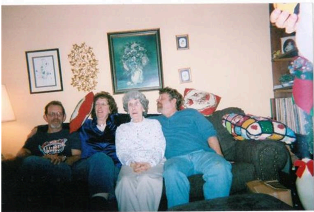
we love you mom