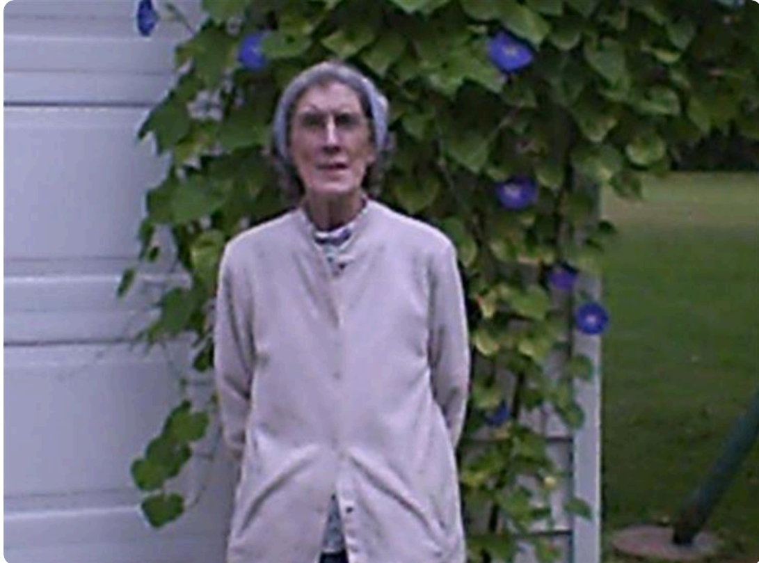
My beautiful Mom with her favorite flowers.